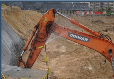
Automatic sprinkler system has been installed to minimize generation of dust during excavation works.