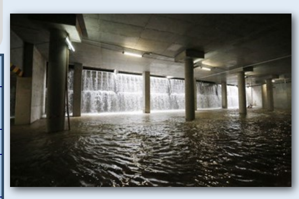
Happy Valley Underground Stormwater Storage Tank